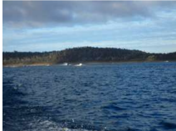
And the start of the great lake trout classic, as boats head out of Swan Bay, headed for their favourite spots to fish.