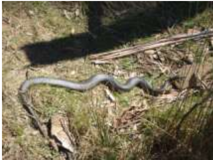
Tiger snake Lake Crescent