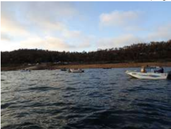
Some of the boats getting ready for the 7 am start!

Arthurs Lake is going to be fascinating, as reports have it fishing really tough at the moment, although there are usually plenty of small fish to be found, so everyone's hoping for big bags of fish to complete the tournament. Check out the tournament facebook page on 29 and 30 November to see how the LPAC teams go!