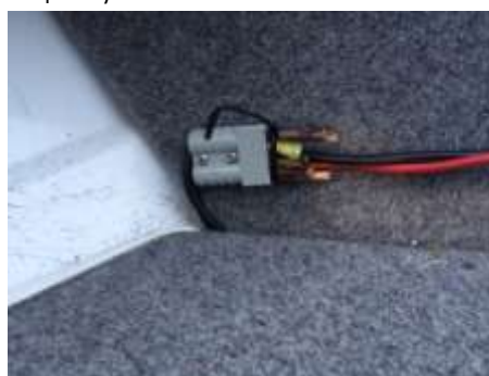
invention by bush electricians