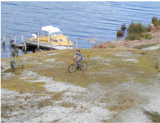
Riding the chalet bikes around Strathgordon